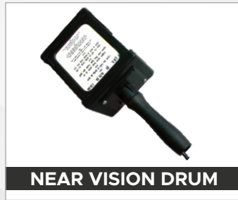
NEAR VISION DRUM