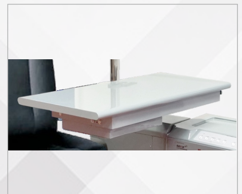
Table Top for 2 Instrument