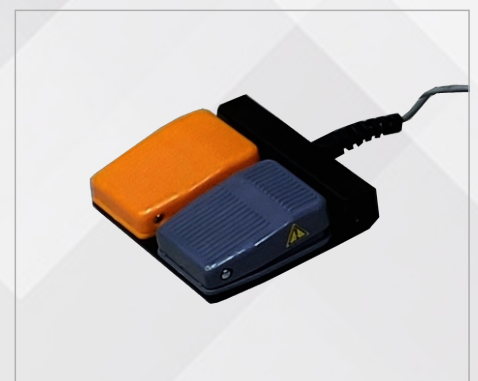
Easy Foot Switch Control