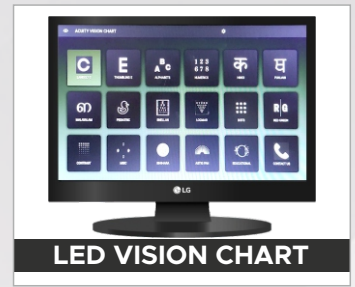
LED VISION CHART