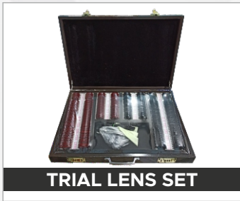
TRIAL LENS SET