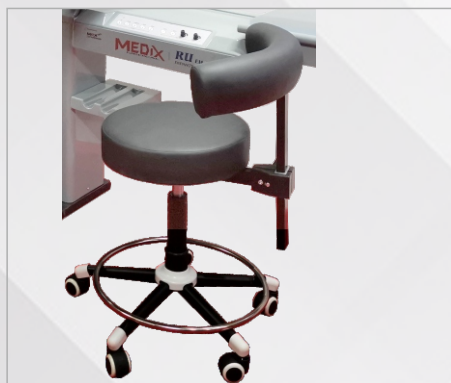
Manual Doctor Stool